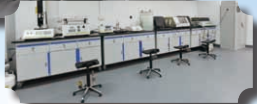
Scientific research facilities of the FIFS