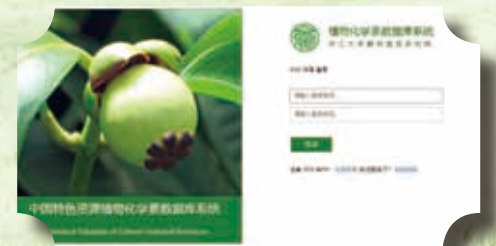
Shared Phytochemical Database of Chinese Featured Resources developed by the FIFS